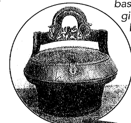
Ornamental baskets were given to Chinese brides on their wedding day.