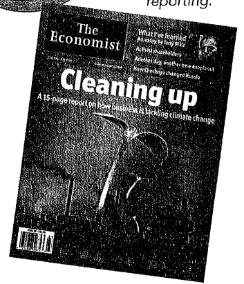
"The best magazine for unbiased world reporting."